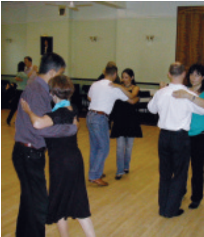
Tango classes are available from beginners to advanced at the Redlands Club